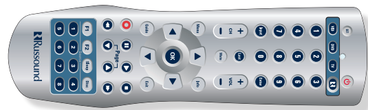
C5 Learning Remote Control SRC-C5

*1kHz into 8 ohms with <5% THD+N, 2 channels at full power, 10 channels at 1/8th