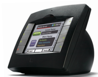
Desktop Color Touchscreen UNO-TS2D

Control for the C5 system comes from the MDK-C5 Multiline Display Keypad. The keypad's high-resolution LCD screen displays real-time information including playlist, channel, artist, song title, genre and more. Responsive hard buttons provide easy navigation of every system feature and source control function through a menu driven interface. A built-in IR receiver allows easy control from the SRC-C5 System Remote Control. The keypad buttons and screen brightness are. For additional control, up to two Russound UNO-TS2 touchscreens can also be connected to the system.